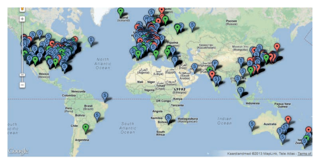
Figure 1. Distribution of robot manufacturing companies around the world (The Robot Report, 2013).

Sadly, things in Latin-America are not good: According to the The Robot Report there are only 3 manufacturers in South and Central America who sells more than 1000 robots a year. In figure 1, every marker points out one robotics manufacturer who sells more than 1000 units a year or startups (green) who have potential to sell 1000 units a year (The Robot Report, 2013). This map is not complete as this information is very hard to find but gives quite good overview of division of robotics industry and knowhow. Most companies are located in developed countries (United States, Western-Europe, Japan and Taiwan) where the use of technology is very high to overcome high cost of human resources. Nevertheless as with computer industry 20 years ago (Greenstein, 2010), soon robots and automated machines will be installed and used in other parts of the world also and therefore it is best time to learn and move into robotics business. Good way to do it is to complete successfully some small and medium size robotics projects and/or participate in research. In this paper we give overview of technologies and tools commonly used in fast development of robotics projects.